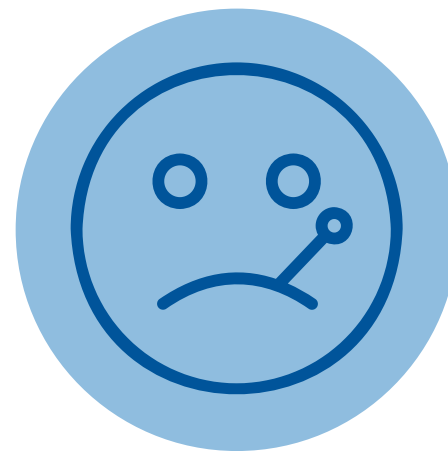
Long-term Illness Cover