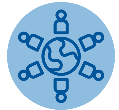
Day of Leave for Significant Cultural Meaning