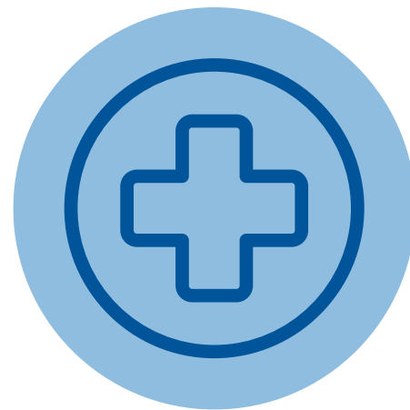
Private Health Care